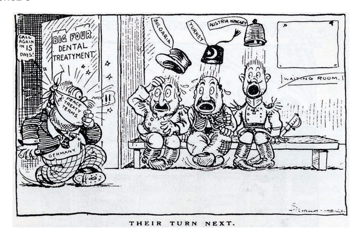
A cartoon entitled 'Their Turn Next', published in a British newspaper, May 1919.