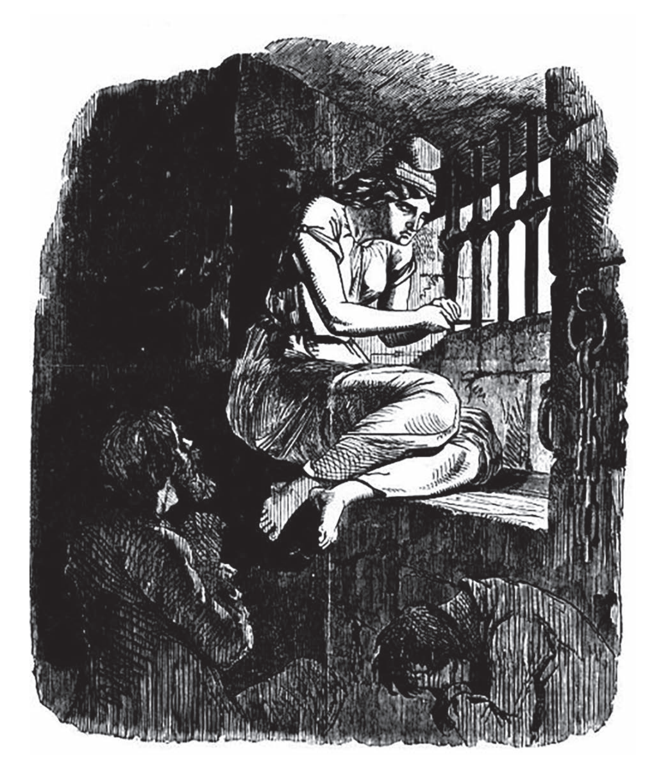
An illustration published in a British magazine, September 1856. It is entitled 'Liberty files the Austrian Bars of Italy.' 'Files' means cuts away.