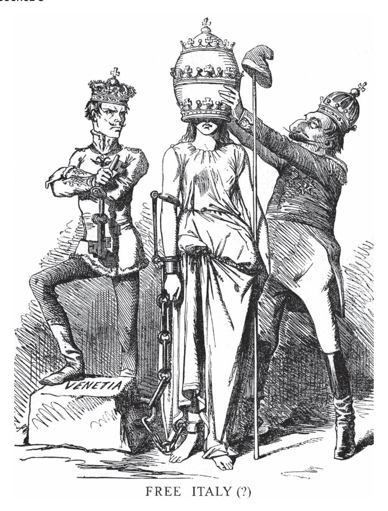
A cartoon published in a British magazine in July 1859. The figures represent (left to right) Austria, Italy and Napoleon III. Italy is wearing the Papal crown.